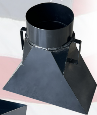
8" Batt Attachment