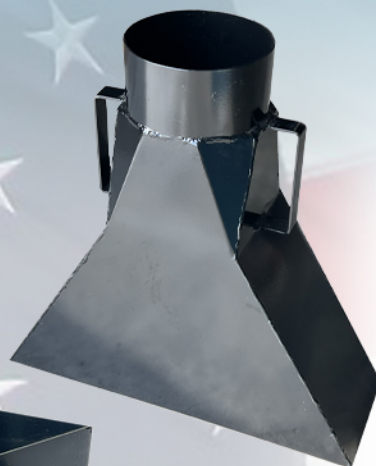
6" Batt Attachment

The batt attachment is designed to be used with the GV240 vacuum. The attachment is used to funnel fiberglass batting into the hose for a faster, easier removal process.