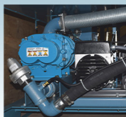
Optional 7800 watt Generator Powers auxiliary 120VAC outlets Positive Displacement Blower w/250 CFM @ 6PSI