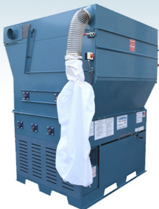
Wall Spray Recycle Hood Designed w/filter bag & slidegate for dust free environment