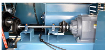
Speed Reducer powers the drive system