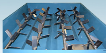
Dual upper & Multiple lower Agitators Designed for maximum conditioning and material flow